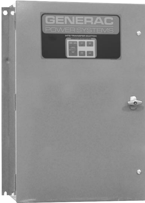
200 Amp HTS NEMA 1